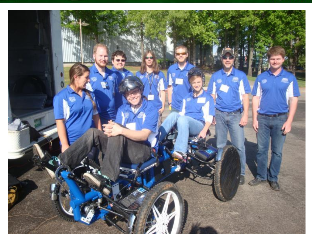
Tennessee Technological University submitted a Safety Analysis