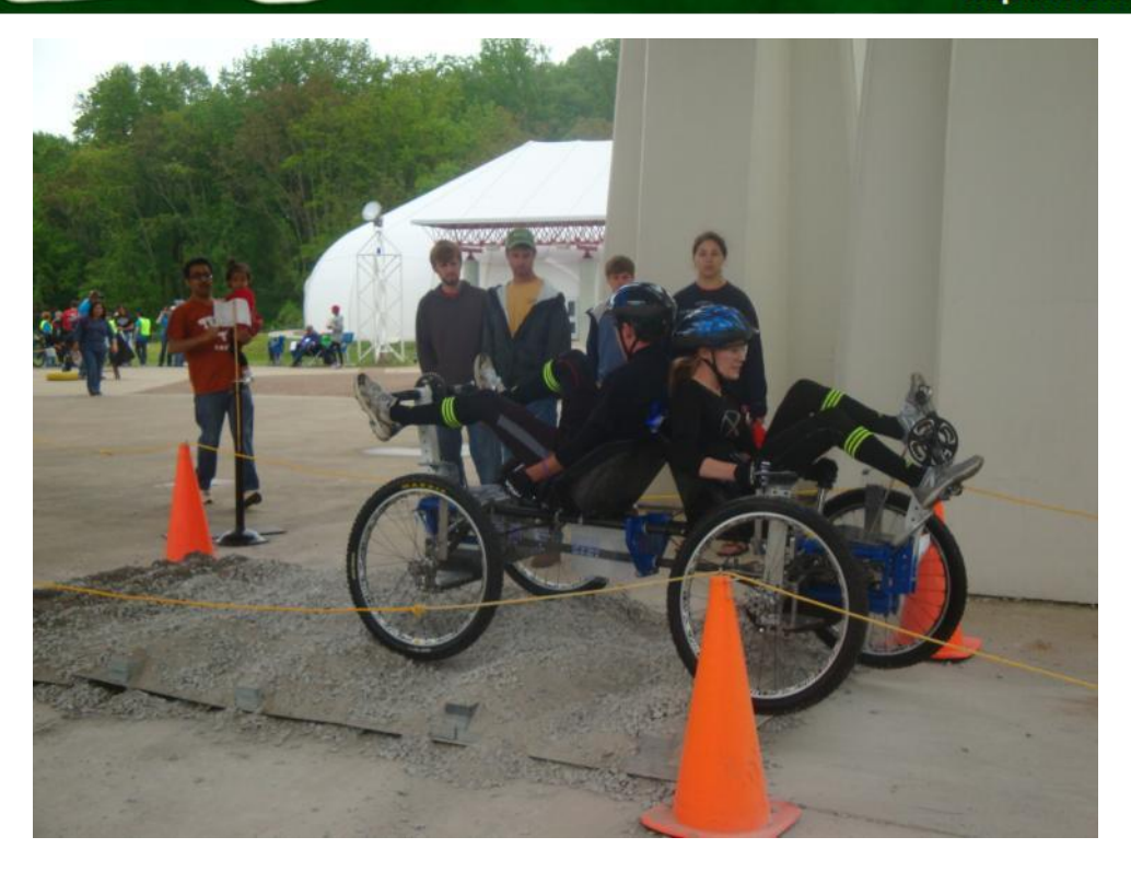
UAHuntsville Team driving over moon craters