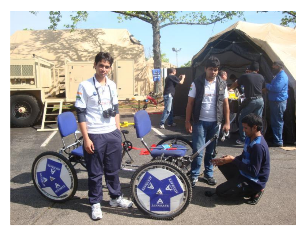
Accurate Team submitted a Safety Analysis